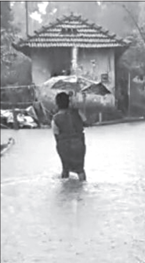
A woman wading through a waterlogged street following heavy rainfall in the upper Kuttanad area of Kerala

As per the weatherman, Kerala has received 833.8 mm rain during the period of October 1 to 15 while the normal average rainfall was 407.2 mm. There is a departure of 105 per cent. Pathanamthitta district received 194 per cent extra