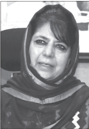
PDP president Mehbooba Mufti

Jammu, Udhampur, Kishtwar, Reasi, Samba and Kathua in Jammu division and Anantnag, Kulgam and Shopian in south Kashmir are the districts covered under the declaration. R S Pura, also known as the rice bowl of Jammu region and the major grower of internationally acclaimed Basmati rice, was the worst hit due to massive damage to the standing Basmati crop. I am told that the government has assured